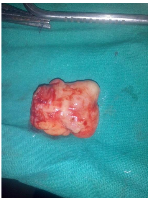
Figure 4: Shows resected specimen of Meckel's diverticulum.