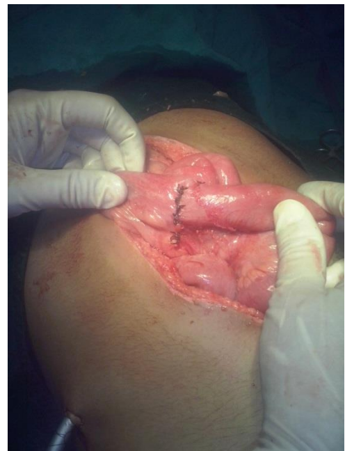
Figure 3: Shows anastomosed ileum after resection of Meckel's diverticulum.